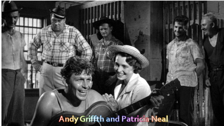
Andy Griffith and Patricia Neal